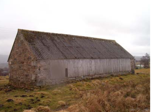
Figs. 3 and 4 front and rear elevations of building to be removed.

2. The building proposed for replacement stands on flat ground with rising ground to the rear. There is some wet ground to the rear of the building. The existing building is of a traditional stone construction with a cement fibre sheet roof and is in a relatively poor condition. A timber roof structure is in existence with lums at