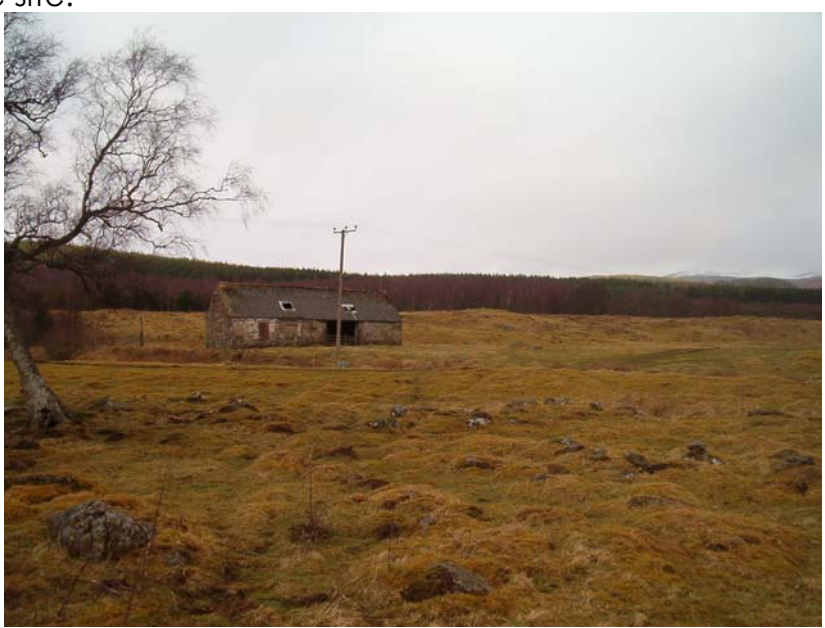
Fig 2. Distant view of site/building from east

1. The site lies on the west side of the A9 approximately 1 kilometre north of Kincraig and is visible at a distance from the A9 (see fig 1). The site would generally be accessed from the B9152 just north of Kincraig where an access lane goes through a tunnel under the A9. A track then leads towards Kincraig Farm past a modern agricultural building and the site is then accessed along a green track which runs up to and beyond the existing building. It would also be possible at times to access the A9 directly from the site.